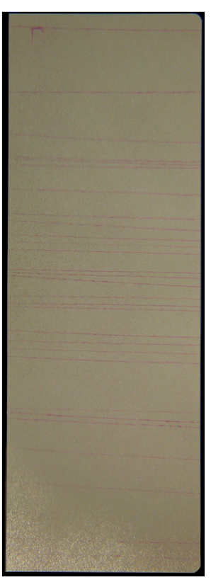
Indication by day light

Treatment with a <u>red fluorescent</u> penetrant